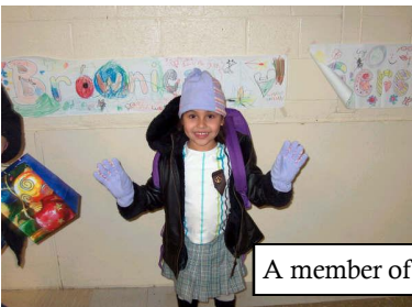
A member of our Brownie Troop showing the gloves she made

If you would like to learn more about other programs that Circle of Life — Arts for All offers or if you have questions, please visit our website: www.circleoflife-eh.org , or call us at 291-8747.